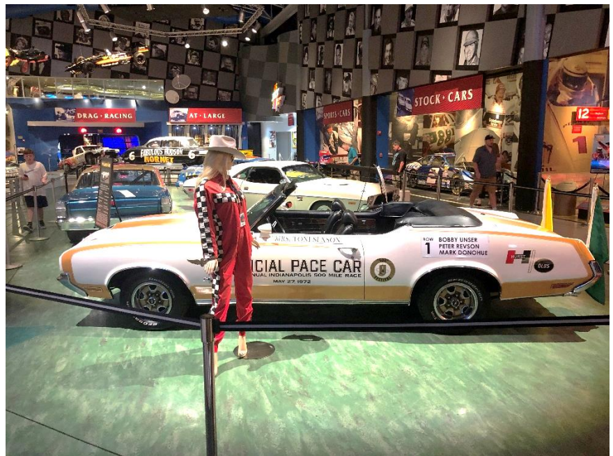
Photos taken at the Motorsports Hall of Fame Museum Daytona, Florida